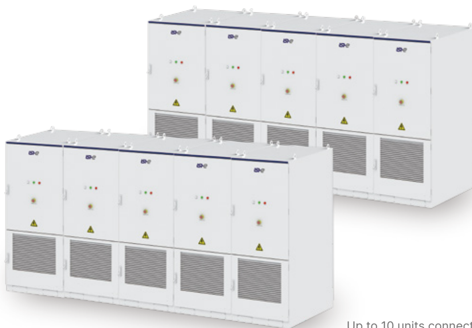
Up to 10 units connected in parallel

It supports independent use of off-grid or micro-grid, and can also be operated with wind energy, diesel generator and photovoltaic systems.